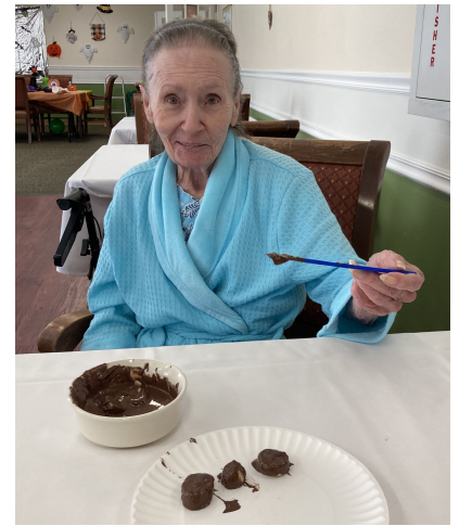
Ms. Gwen enjoys when the activity is an edible snack.